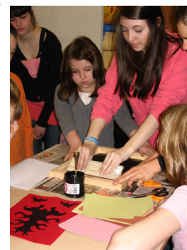
A senior student assists children from younger grades at Oyster Pond Academy

The ArtReach program offers a vital and necessary educational service by providing access to art works and techniques for students who live in rural areas of Nova Scotia.