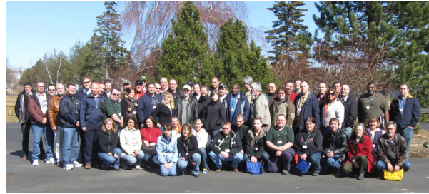
Some of the group at Tech TuneUp, March 15–16, 2010