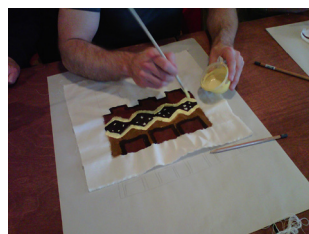
African Mud Art activities were enthusiastically received at the implementation workshop for Social Studies 6: World Cultures.