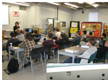
Students participating in the Building Futures for Youth program from Halifax Regional School Board attend their first week of safety training at NSCC.