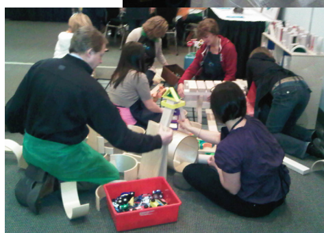
Primary teachers were actively engaged in hands-on activities in Yarmouth on May 11, 2010.