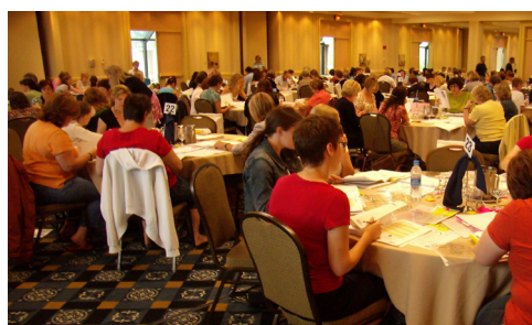
Each year over 1 000 teachers participate with the department in developing, field testing, administering, and marking provincial assessments.

In early spring of each school year, the Department of Education publishes the assessment schedule for the following school year. The schedule for 2010–2011 has been created to accommodate adjustments to the school year calendar resulting from the 2011 Canada Games.